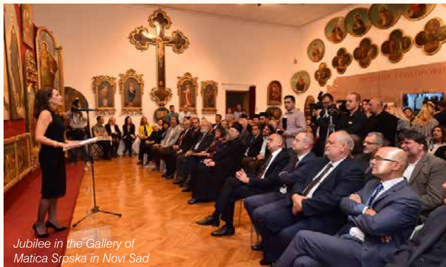
Jubilee in the Gallery of Matica Srpska in Novi Sad

Celebrating the completion of the façade restoration works, a magnificent programme was held on 1 st June featuring an artistic light spectacle and musical performance in cooperation with the Academy of Arts in Novi Sad and the European Capital of Culture Foundation. On this occasion three exhibitions were opened, showing the Gallery's strategic commitments. Aimed at the promotion of gift donations as an essential value of Matica Srpska, the Ivanka Acin Gift Collection was put on display. The exhibition Images of Ephemeral World: Links Between French and Serbian Intimism , organized in cooperation with the French Institute in Serbia, noted the necessity of per-