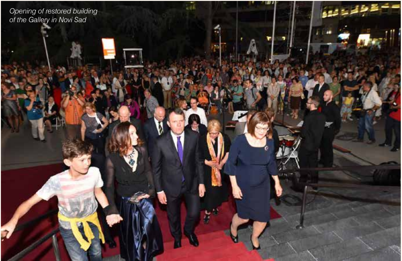
Opening of restored building of the Gallery in Novi Sad

Finally, several conservator stories were introduced into the permanent collection in order to make the audience familiar with this valuable activity of the Gallery.