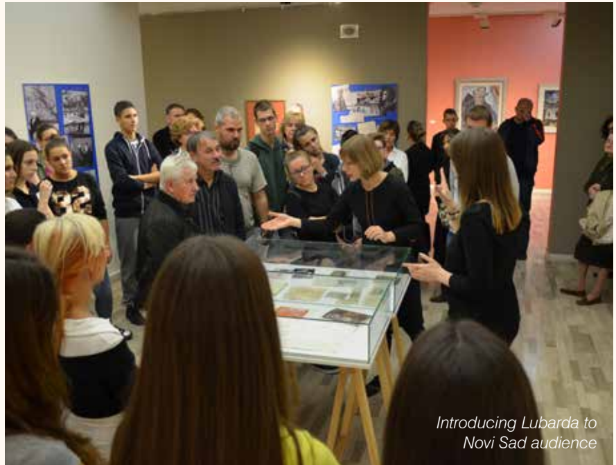
Introducing Lubarda to Novi Sad audience

The outcome is an exhibition featuring thirty works of art and sixteen accompanying panels, illustrating the stages in Lubarda's artistic biography – from his first recognition on the international and home visual arts scene, to the World War II period, to establishing himself in the Yugoslav and international art in