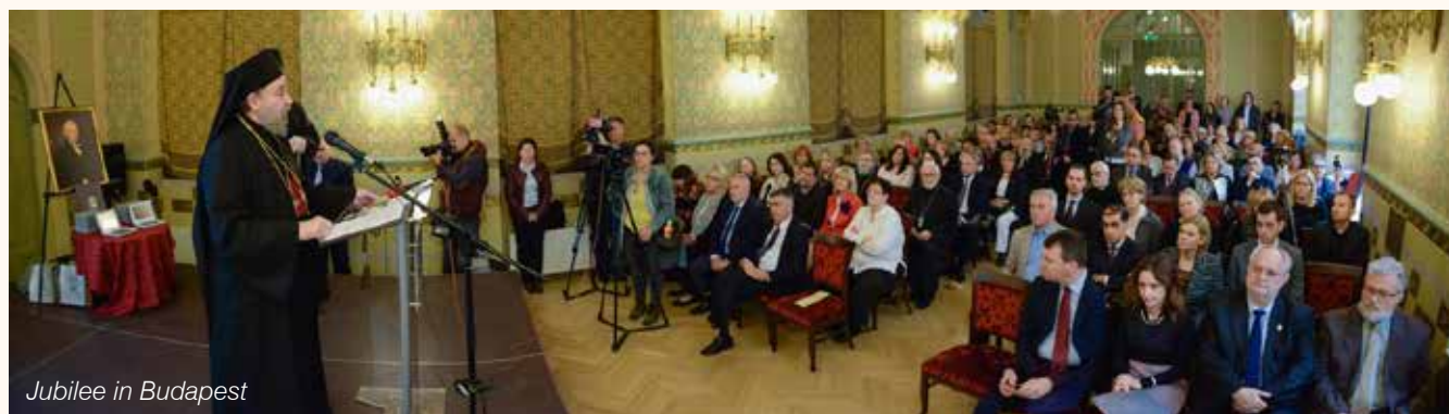
Jubilee in Budapest