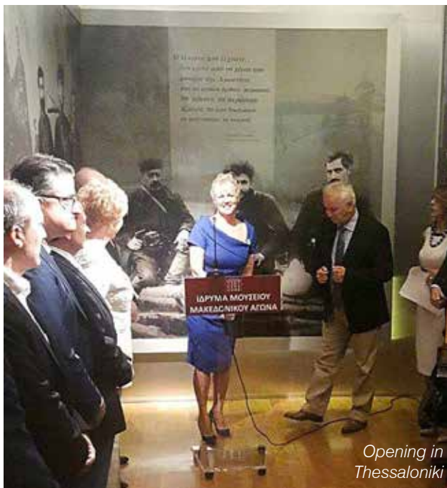
Opening in Thessaloniki