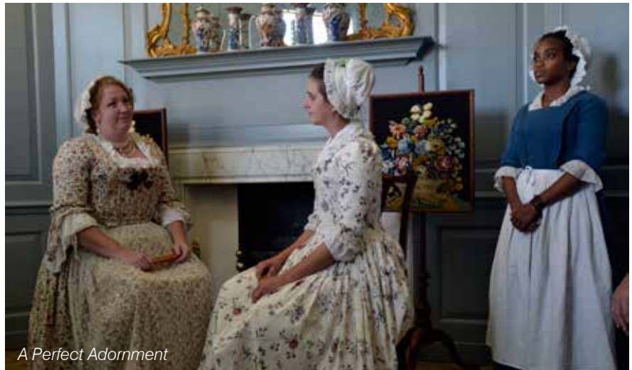
A Perfect Adornment

The most compelling show is Journey to Redemption , which is not a one-way theatrical interpretation. It is difficult to explain what Redemption is in theatrical sense, just as it is difficult to comprehend the very concept and the scale of the process of redemption in real life. Owing to parallel and also intertwining narratives, there is not much space for thinking during the play – you simply have to go with the flow. However, the emotional and cognitive accents are perfect and unconditionally keep the spectator tensed. Six actors build twelve characters: six historical and six real-life ones – themselves. These are biographies as much as autobiographies, and histories as much as confessions. Conversions from “self” as a character to self as a real person (also played) are so subtle that chronologies become intertwined. The past becomes as relevant as the present, the values and meanings not being lost along the way. Journey to Redemption is a drama and an art performance, a theatre and a reality show, a still image and a motion. This is Colonial Williamsburg at its qualitative peak at this point – pushing the boundaries and limits of performative interpretations.