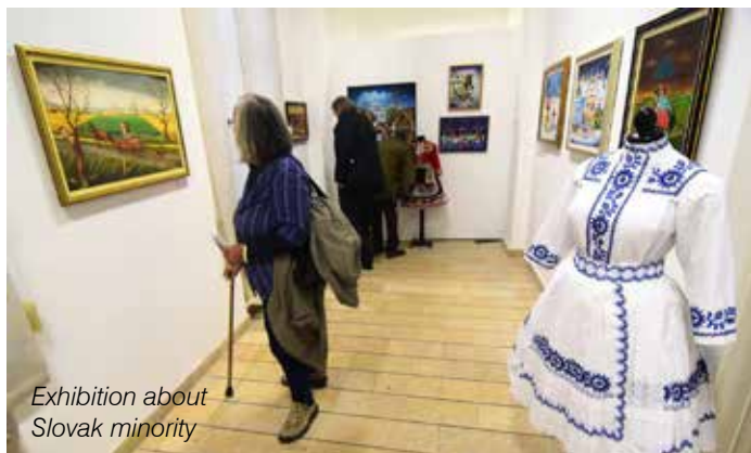
Exhibition about Slovak minority