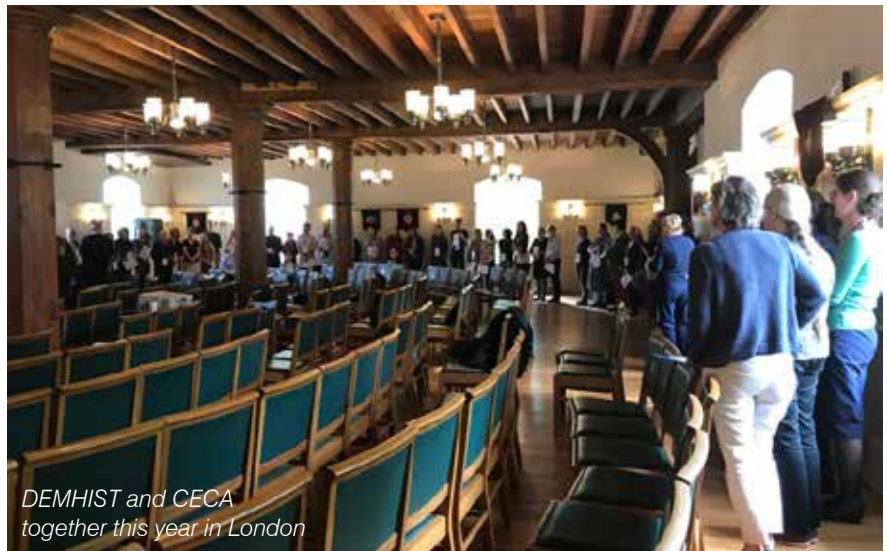
DEM HIST and CECA together this year in London

The idea of the two ICOM committees organizing a joint conference proved excellent. The members of CECA Committee gave an exceptional contribution to the discussion held by DEMHIST members re-