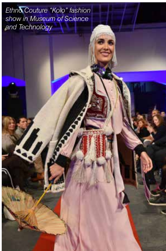
Ethno Couture "Kolo" fashion show in Museum of Science and Technology

Belgrade audience gave a standing ovation to the closing programme of the first Ethnology Fest which offered an interesting model of cooperation among museums, entrepreneurs and the civil sector that could take hold for a long time with a little effort from all the parties involved.