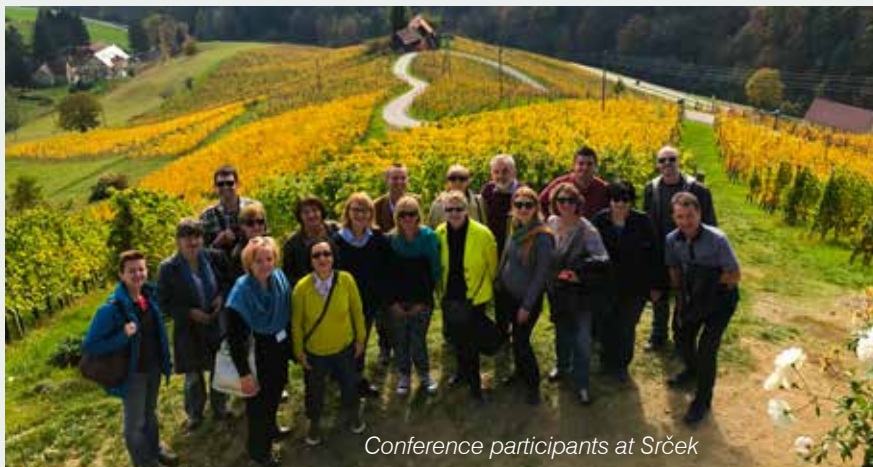
Conference participants at Srček