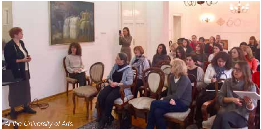
At the University of Arts

The participants learned about different practices of research and recontextualization of suppressed personal or collective memories,